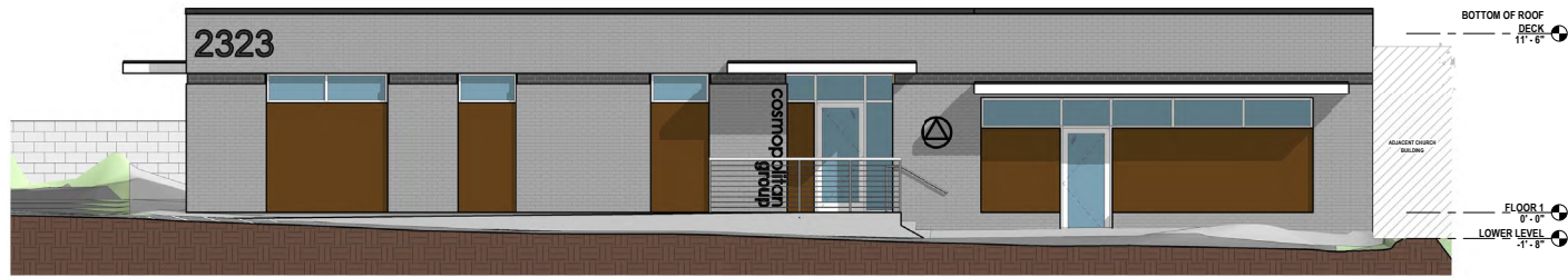
DURWOOD ELEVATION (WEST) 14' x 13'