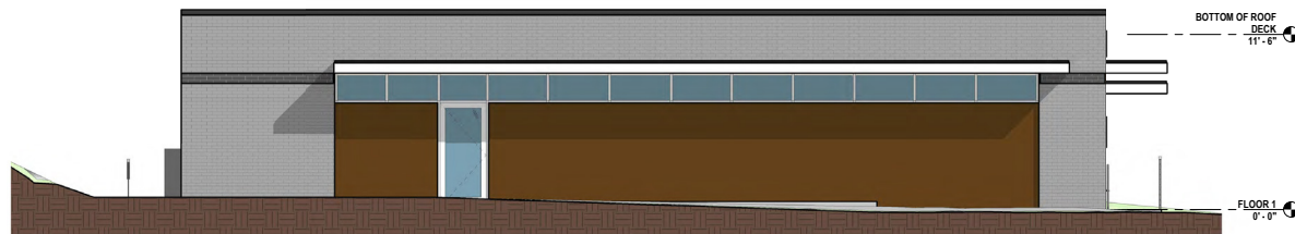
HAWTHORNE ELEVATION (NORTH) 14' x 13'